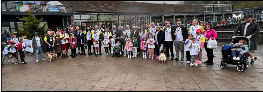
Middle Ward Sponsored walkers.

Over 60 Brethren and their families took part in the 2023 Kiltwalk, with Lodge St. Bryde No. 579 well represented. All proceeds from this important charity event will be forwarded to CHAS, the children's hospice. Well done everyone !