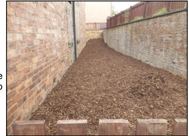
The East of the Hall (ladies toilet wall on the left)

planned landscaping of the East and North sides of the Hall were completed. After weedkilling, a membrane was laid and some five tones of woodchip spread over the area. Essential roof work was also carried out, the gutters on both sides of the main hall were cleaned out, the valley gutter cleaned and the gutters at the front of the hall