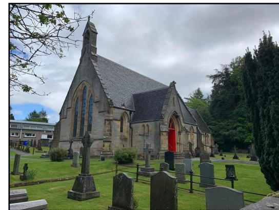
Dunblane Church where the family are buried.