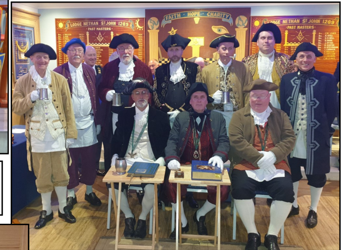
Mother Kilwinning Auld Degree Team