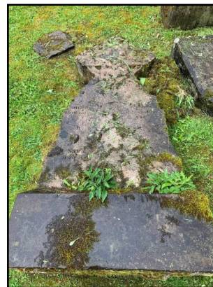
The family grave at Dunblane

I visited the church today as I was working close by. The grave and the one next to it are fallen, and in poor condition. I cleared the moss off as best I could to get a decent picture. It is good to finally know where our first RWM is interred as it is an important part of the Lodge history.