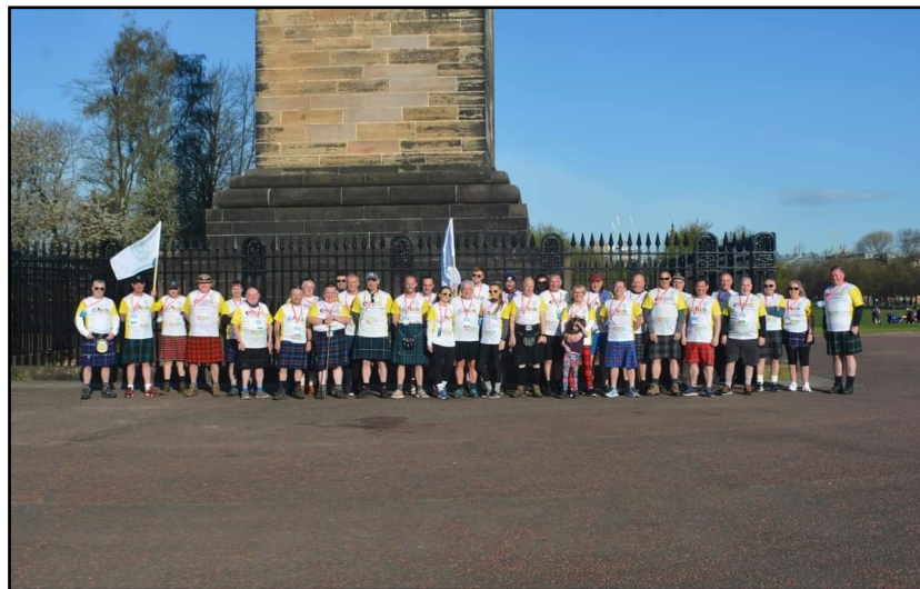
Provincial Grand Lodge Kilt Walkers