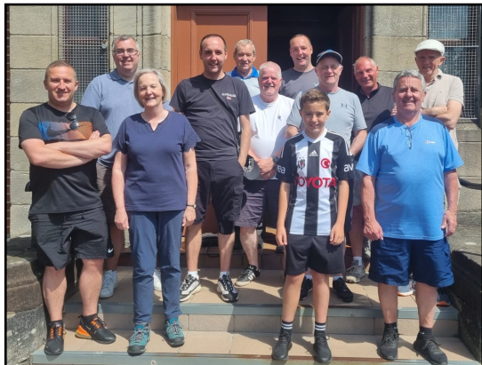
579 Walkers at the half way stage !

This year as last, the proceeds will go towards the Provincial Grand Masters CHAS appeal.