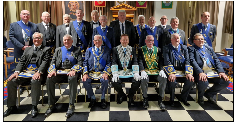
The Brethren that attended the meeting of The Lodge of Integrity No. 4563 in Birmingham on the 1st. October 2022.

Defibrillator. On Thursday 20th. Oct. The Emergency Services Control desk despatched our defibrillator for public use. The supplier was contacted by the Control Desk and also informed of their action. The supplier checked out the unit and made it ready for service the next morning.