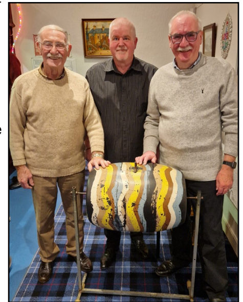
Christmas Draw 2023 Almoner, Senior Warden, RWM