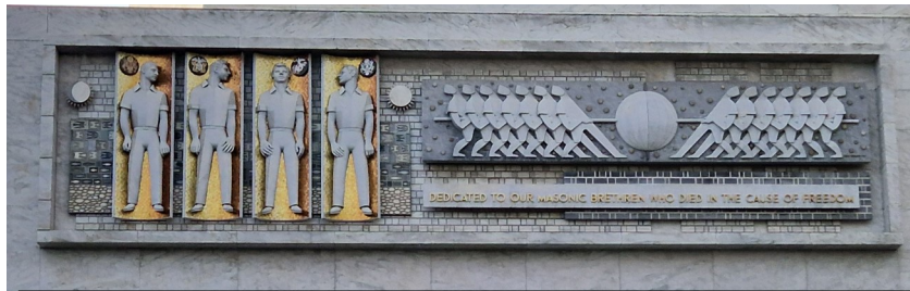
Masonic artwork on the exterior of the building which was dedicated to all those who gave their lives in the cause of freedom.