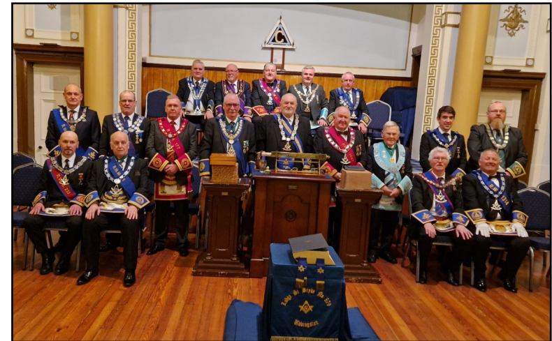
A fantastic photo of Reigning Masters who attended our Reigning Masters Degree. On 10th. January

had come to support their Right Worshipful Master, increasing the attendance to 80 !. It was a well constructed Degree , sometimes difficult to achieve when Brethren are using different Rituals ! The Lodge would like to thank all those who attended and helped make the night such a success.