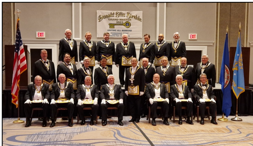
Grand Lodge of Virginia 2022-2023