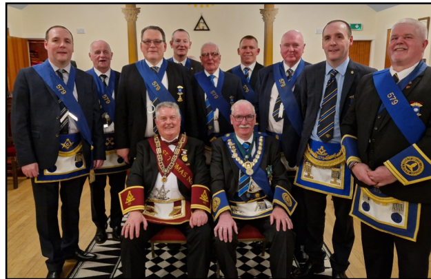
Lodge St. Bryde Degree Team at Lodge St. Thomas