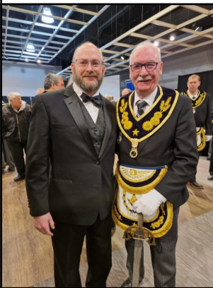
Two 579 Brethren

On Friday evening my wife and I attended the formal Kansas Masonic Foundation Charity Dinner and Auction which raises thousands of dollars a year for cancer charity. The items that we took over raised almost $5,000.