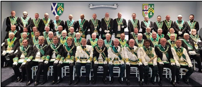
District Grand Office-bearers with the Grand Lodge Deputation.