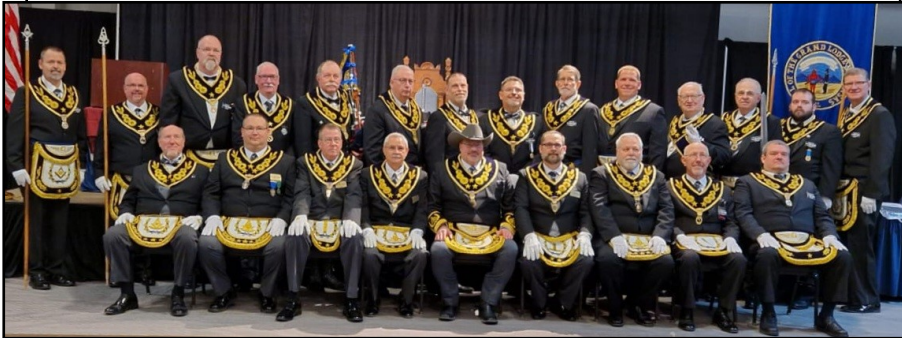
Grand Lodge of Kansas Office-bearers 2023

On Friday evening my wife and I attended the formal Kansas Masonic Foundation Charity Dinner and Auction which raises thousands of dollars a year for cancer charity. The items that we took over raised almost $5,000.